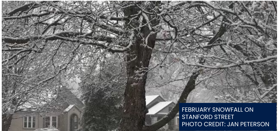
FEBRUARY SNOWFALL ON STANFORD STREET